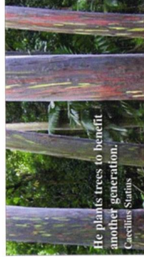
Thank you for supporting LandCare.

Please contact Thornton Public School via thorntonps.p.and.c@gmail.com for more information.