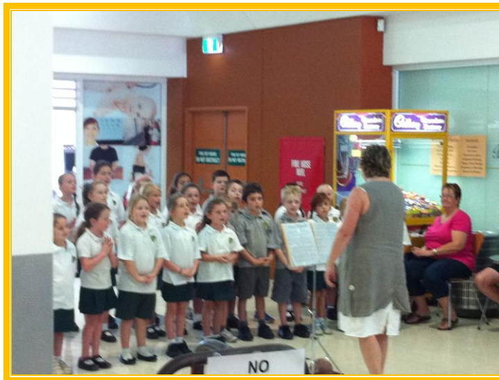
Stage One Choir

Under scheduling your child: http://www.schoolatoz.nsw.edu.au/wellbeing/health/benefits-of-underscheduling-your-child