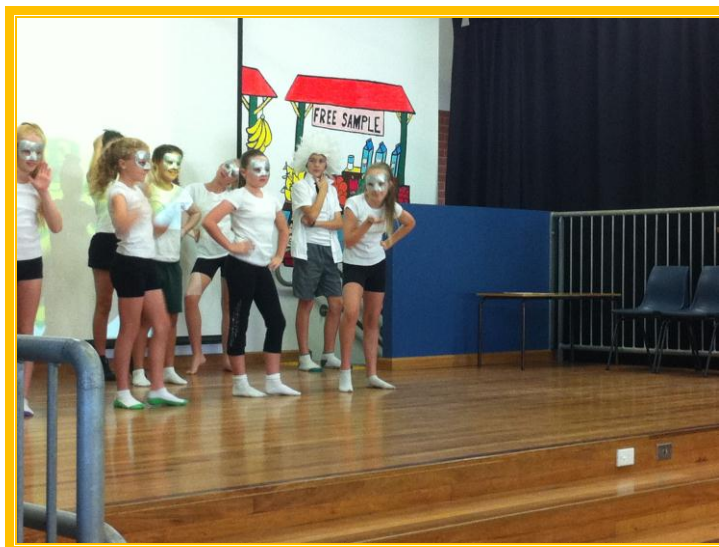
Stage Three Dance Group