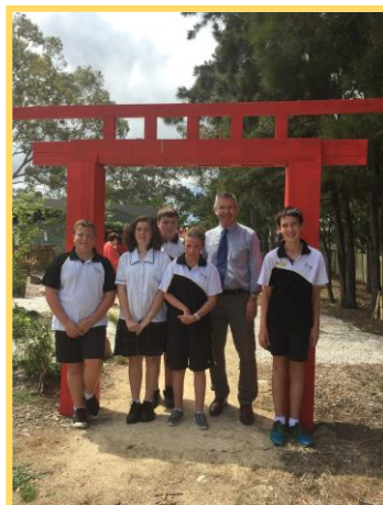
FGHS Japanese Club