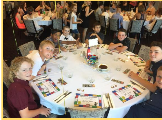
Incoming and Outgoing Captains...