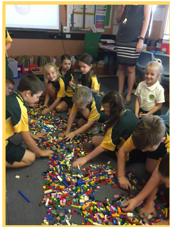
Lego at Lunch Time