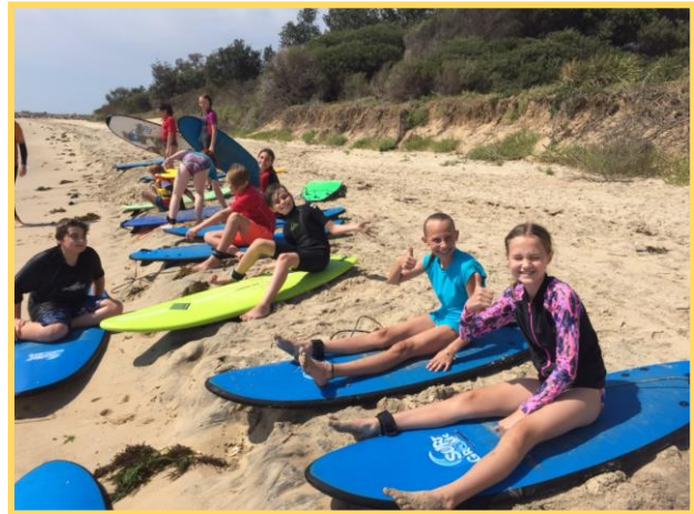
Year 5 and 6 at Surf Lifesaving at Stockton Beach