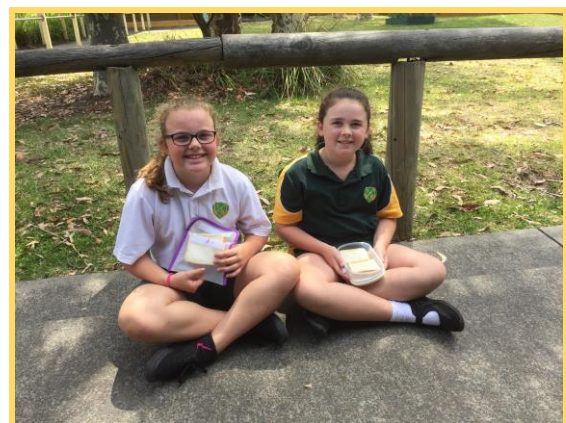
Package Free day went very well reducing our wrappings from over three kilos to barely none