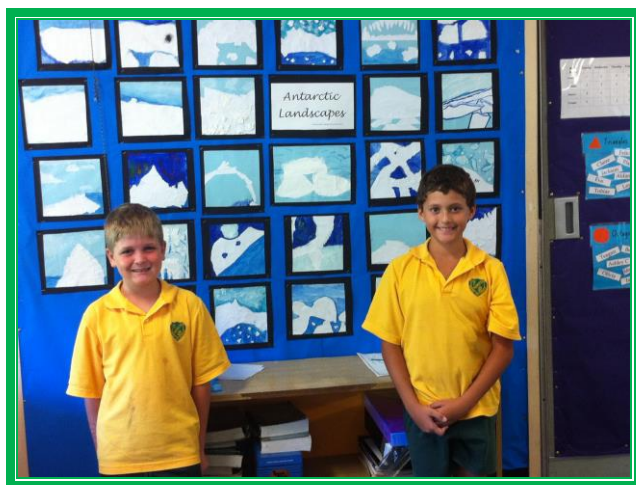
Antarctic Landscapes, 5WS