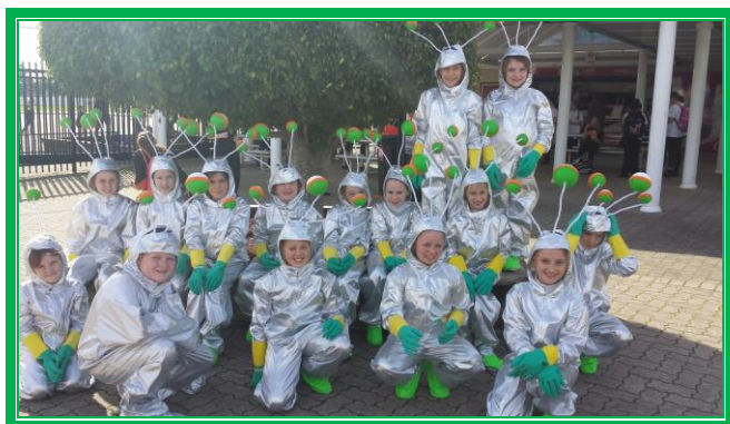
Our Minion Starstuckers