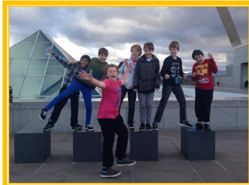
On top of Parliament House