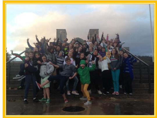
A cold and wet afternoon at the War Memorial