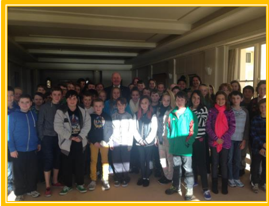
At Government House, with Peter Cosgrove!