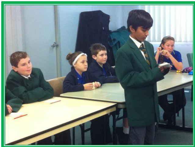
The Year 6 debate