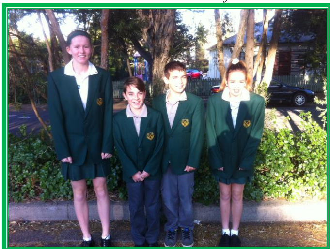
Local Government Breakfast