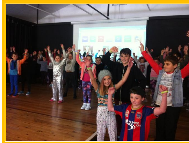
3 / 4 C and 3O performing their Bullying No Way RAP.

At Thornton School we work and play, and shout out loud BULLYING NO WAY!