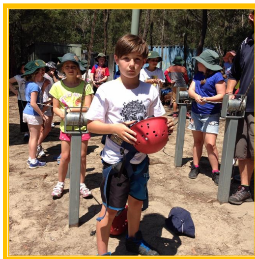
Stage Two leaving for camp and attempting the climbing wall