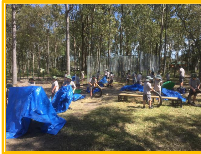
Stage Two Boys at Creative Play