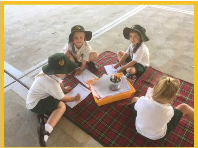
Kindergarten at Structured Play!