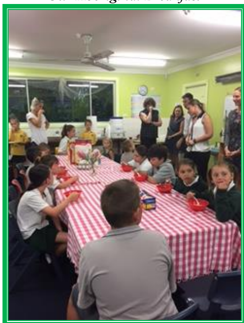
Our Aboriginal Breakfast