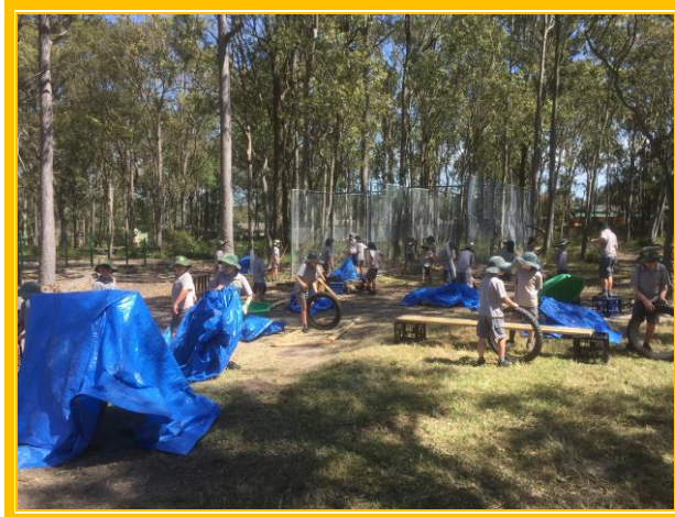
Stage Two Boys at Creative Play