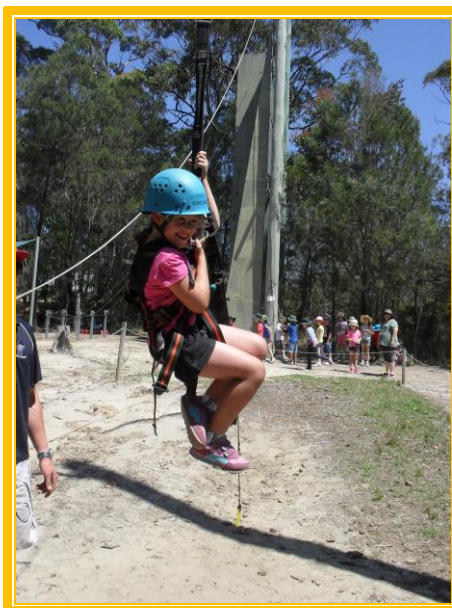
Stage 2 enjoying camp