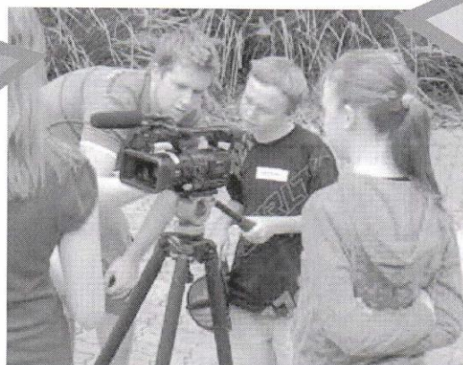
STUDENTS AT THE WORKSHOPS