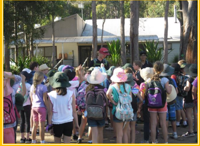
Camp meeting place