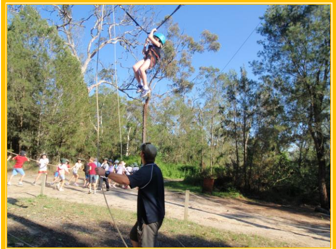
Trying archery and the high swing