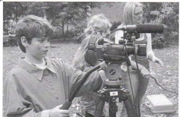
STUDENTS AT THE WORKSHOPS

When? December 2nd, 3rd, 4th - 2015 Where? The University of Newcastle