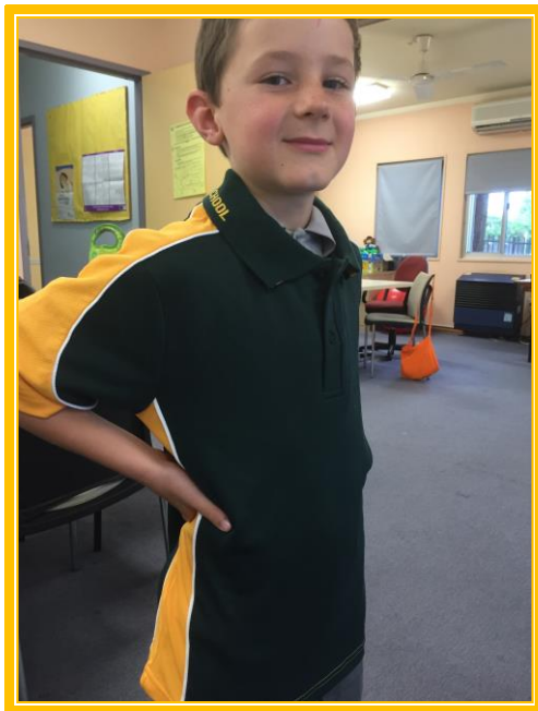
Option 1 (sewn panels)