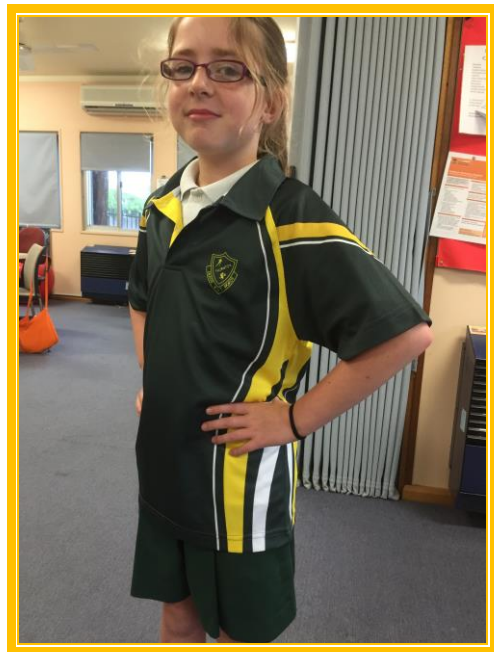
Option 2 (printed fabric)