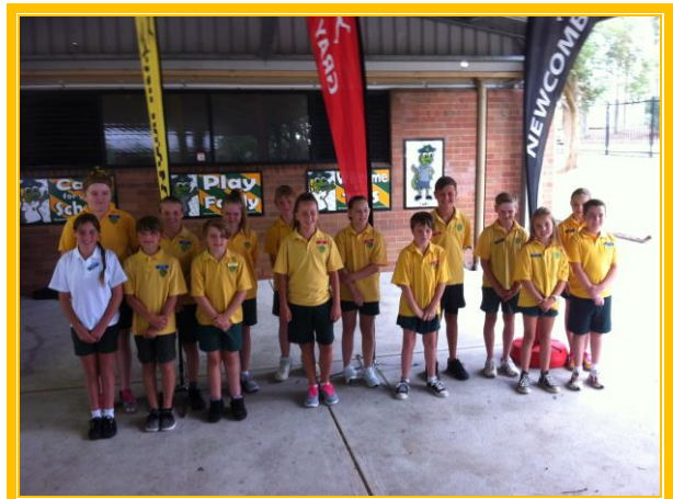
Our wonderful House Captains