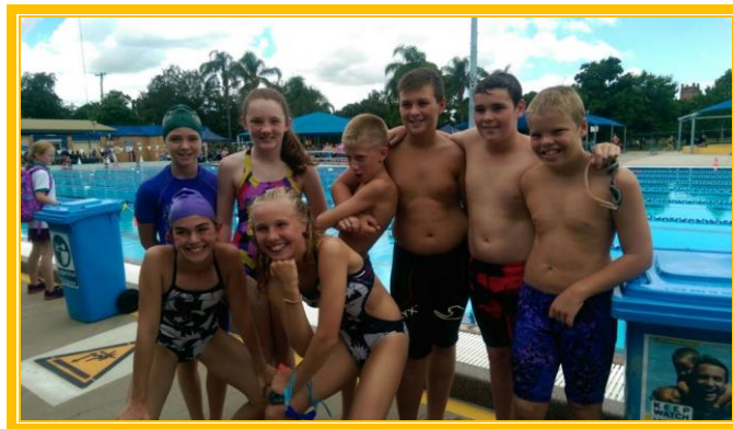
Some of our swimmers!