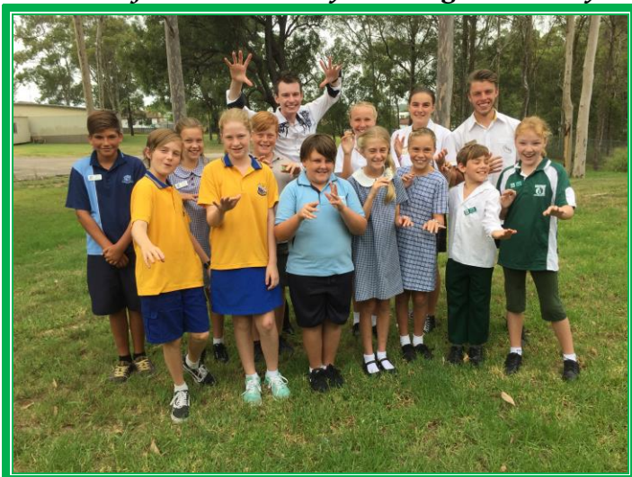
Leaders from our Gateway Learning Community