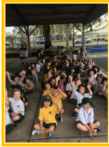
Ready for class