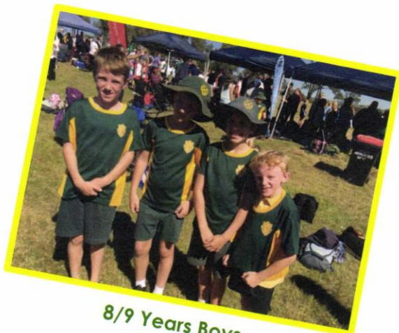
8/9 Years Boys