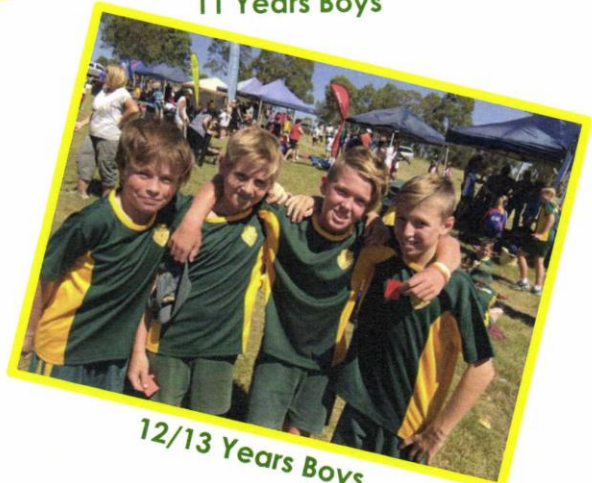
12/13 Years Boys