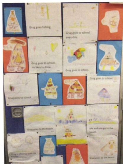
Some of our Grug work