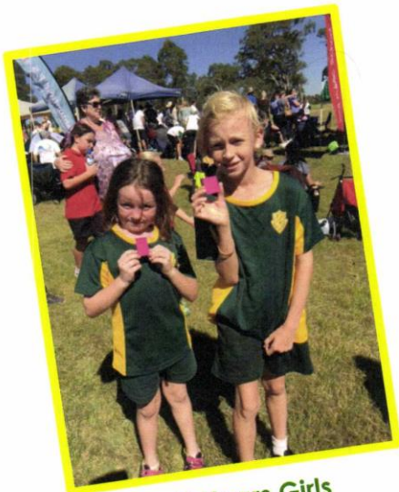
8/9 Years Girls