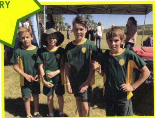
11 Years Boys