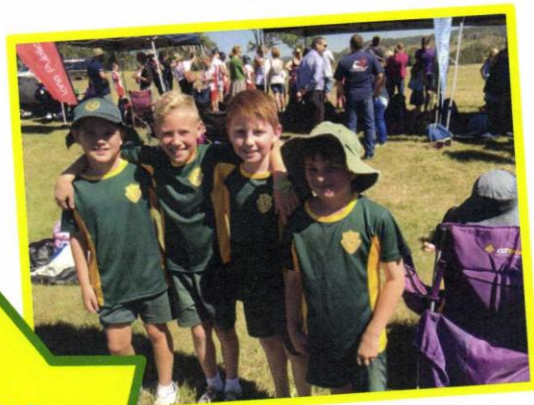
10 Years Boys