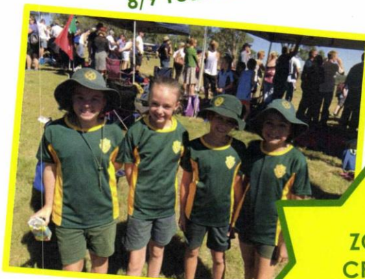
10 Years Girls