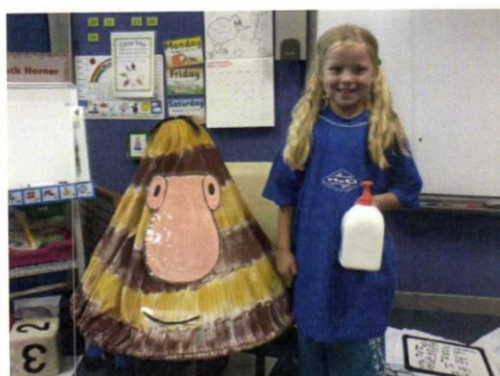
Grug goes to the beach