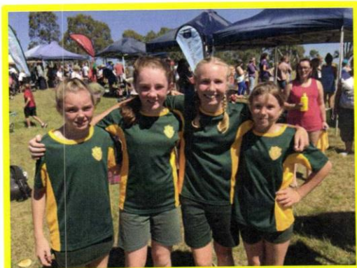
12/13 Years Girls