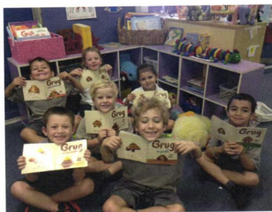
We love to read