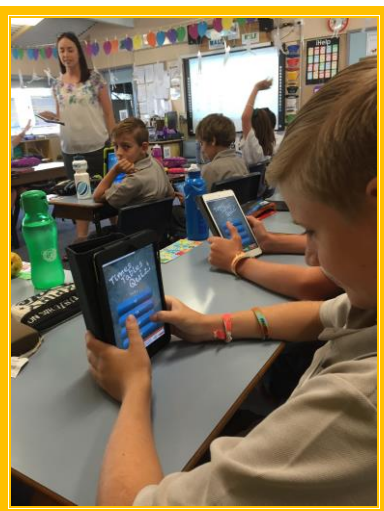
Times Tables and iPads? Great idea.