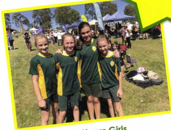
11 Years Girls