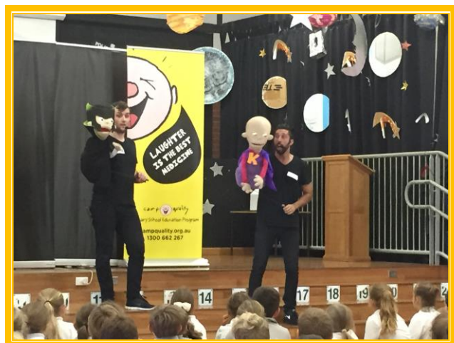
The camp Quality Puppet Show had a great message!