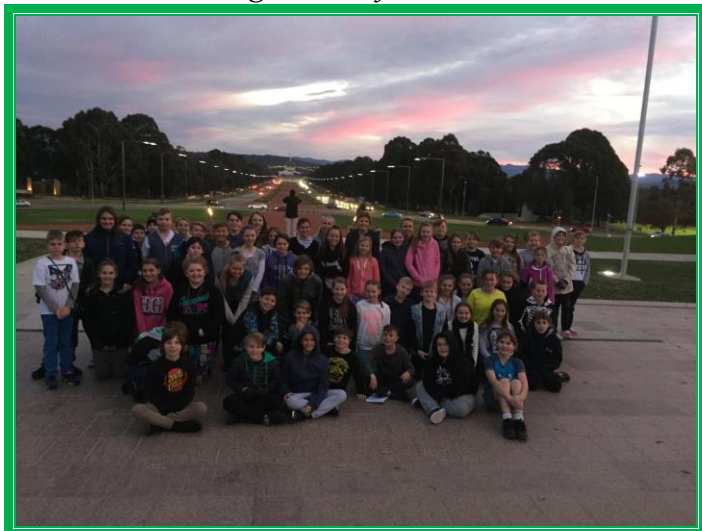
A cold evening outside of the War Memorial