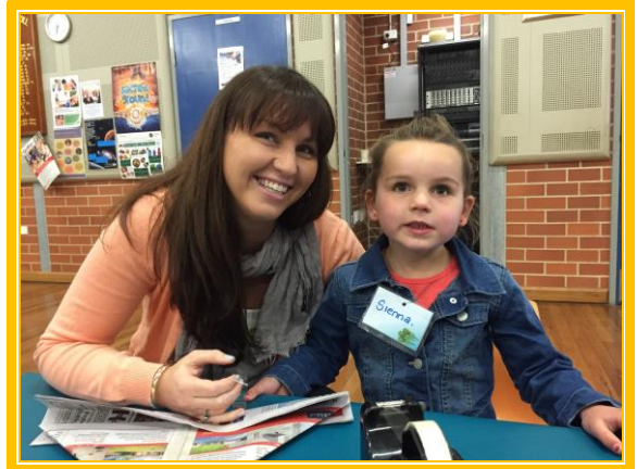
A warm welcome to our Term Three Tadpoles