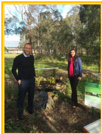
Visiting Irish Principals