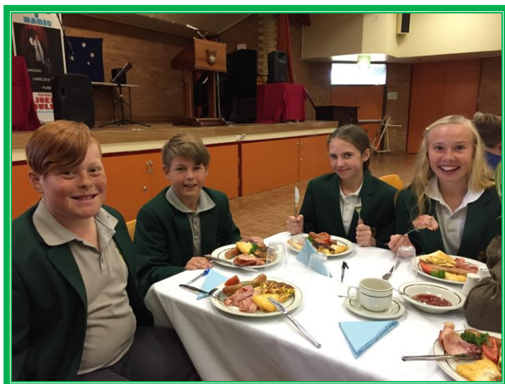
A big breakfast courtesy of Maitland City Council