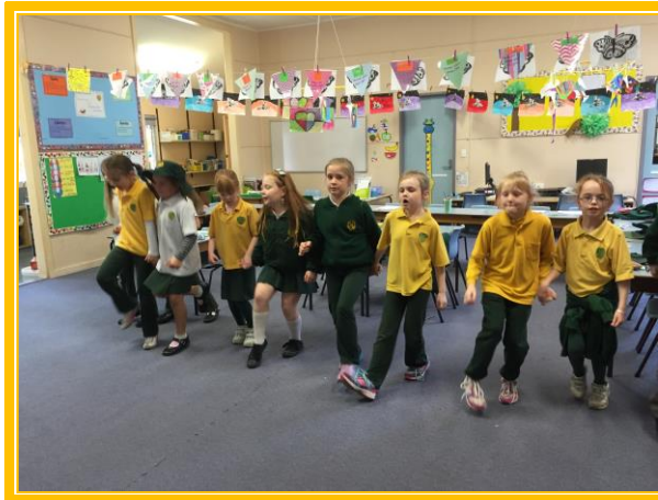
Those Irish Dancers are getting better!