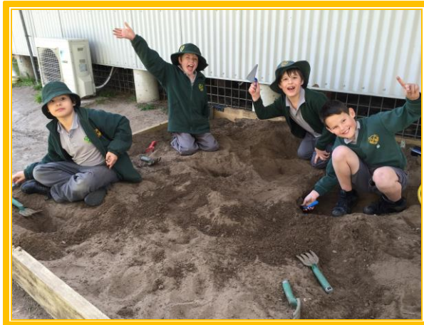
The new dirt pit is a hit!