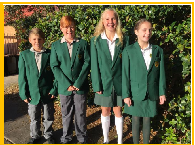
Our Captains at the Council Breakfast