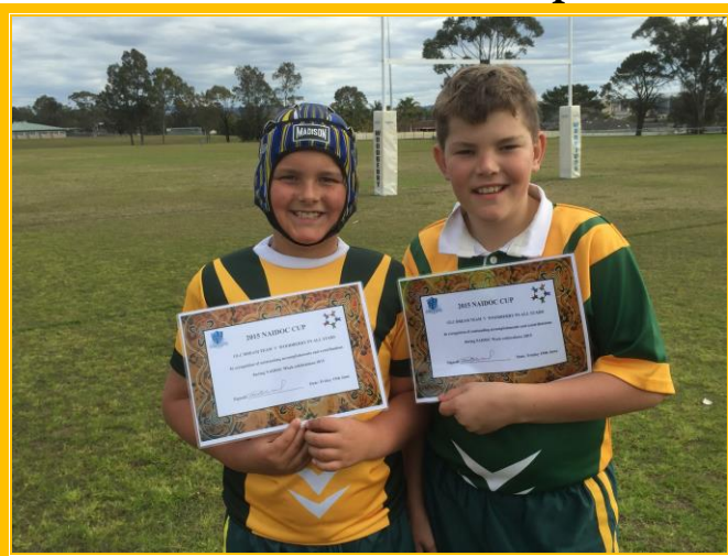
Our NAIDOC Week Footy players