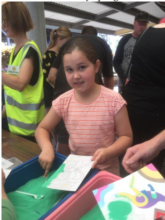
Sand Art at the Kindy Spring Art Table.