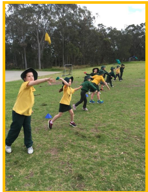
Throwing and catching, never enough!