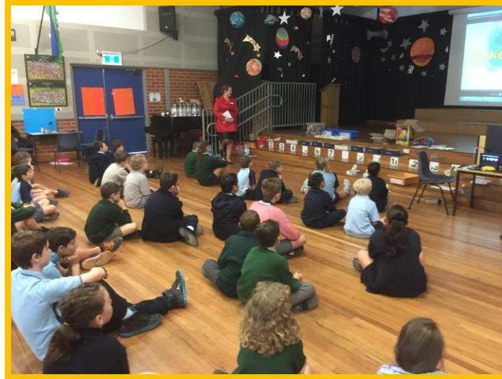
Getting ready for Stop Motion