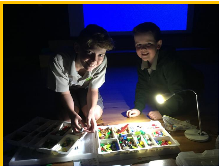
Stage One Stop Motion