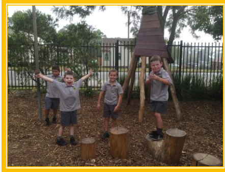
Love this playground...