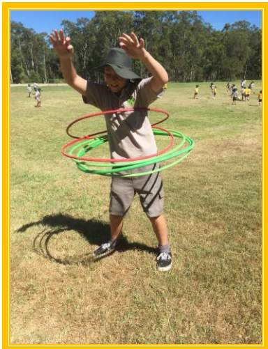
How many Hula Hoops?