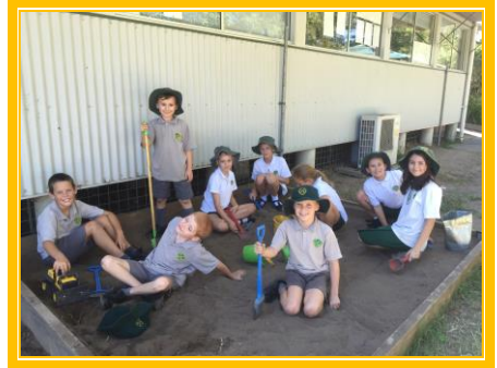
That dirt pit!