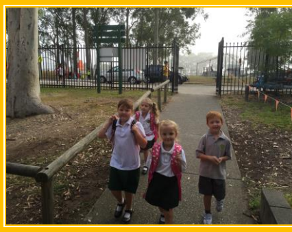
Arriving for school on a foggy morning