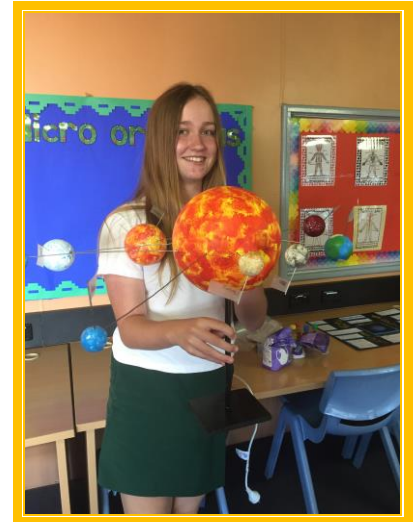
Some fabulous space projects!