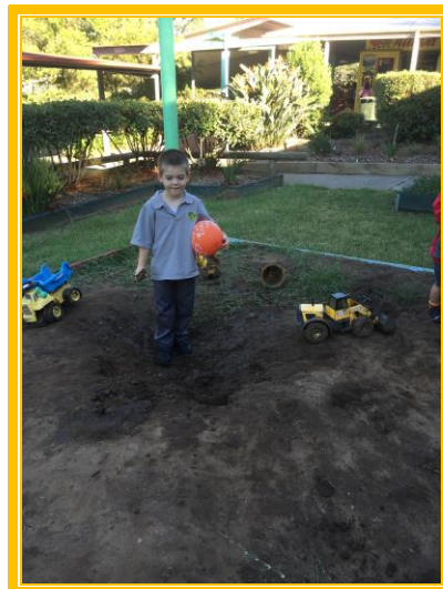
Is it too early to play in the dirt pit?