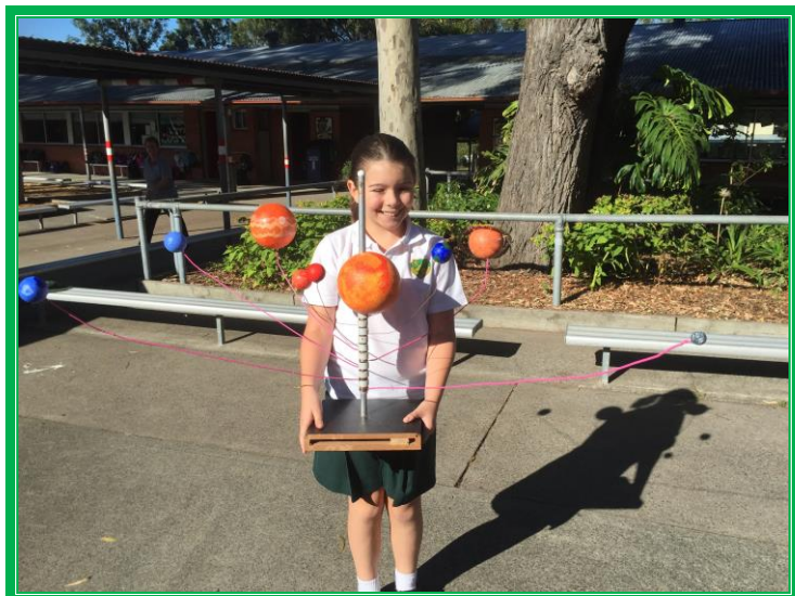
What a Space Project!