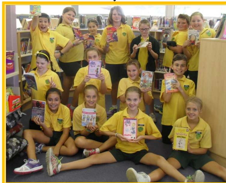
Our wonderful monitors