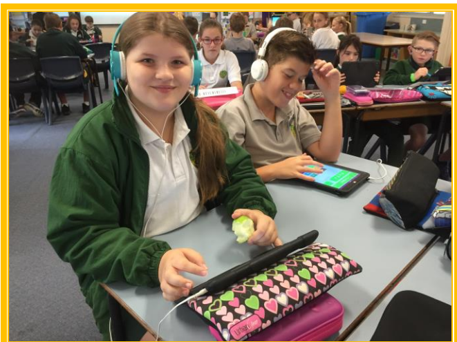
Tables Practice in the BYOD Class