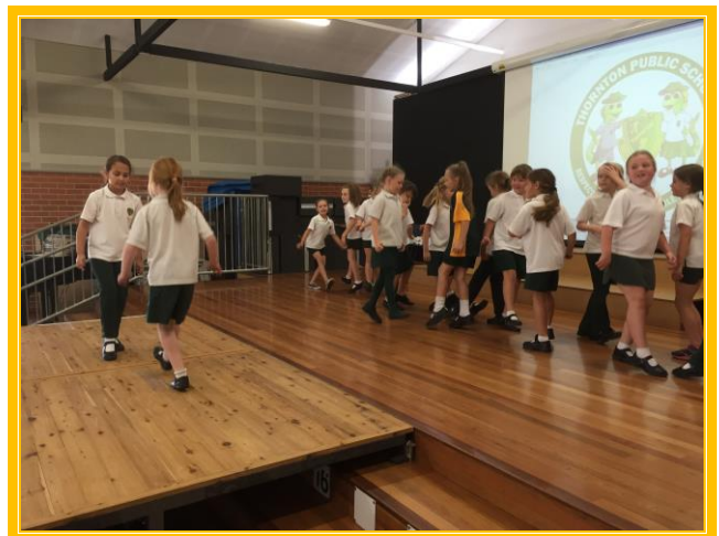
Our Irish Dancers in Action