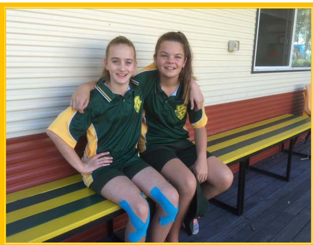
Our Barmah Seat