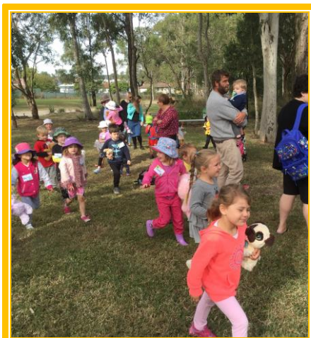
Teddy Bears Picnic