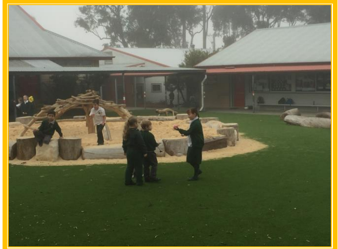
From sunny.....To foggy.