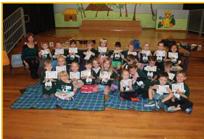
Congratulations to our graduating Tadpoles