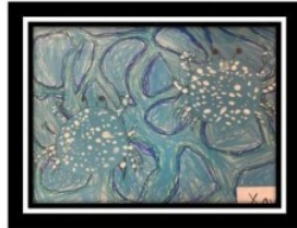
Stage 1 Xavier B 2BN