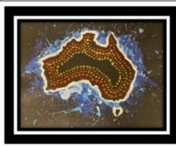
Stage 3 Taniela 5M