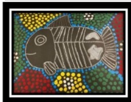
Stage 2 Annabelle 3H